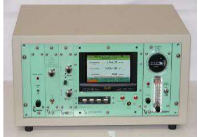
FM-9NGAS-2, FM-9NGAS-3, FM-9NGAS-6S