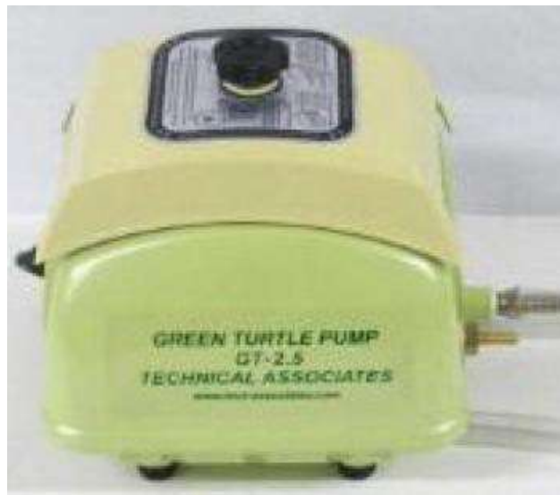
FM-9NGAS - ULTRA LOW NOISE PUMP