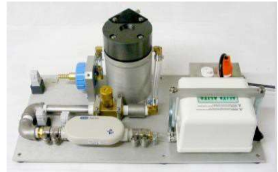
FM-9XE-NG FLOW CELL & DETECTOR ASSEMBLY