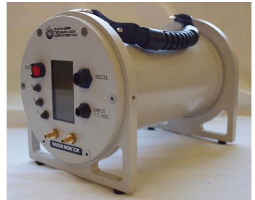
RnCAM - INSTALLED OR PORTABLE RADON MONITOR