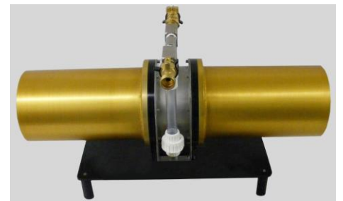
INSTALLED NEX-ALPHA-R RADON IN WATER DETECTOR