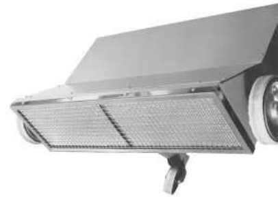
ABFM-SERIES FLOOR MONITORS