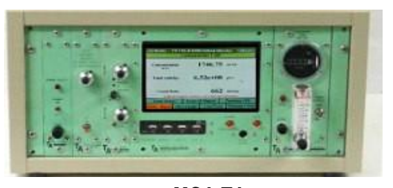
MCA-TA MULTICHANNEL ANALYZER ELECTRONICS