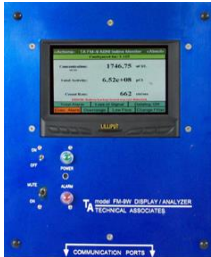
ELECTRONICS Model FM-9W