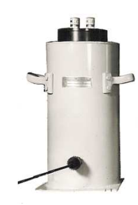
Figure 1: SSS-13

When the SSS-13 is used with a suitable readout system such as FS-5T or a member of the FM-7 modular ratemeter recorder series with alarm capability (e.g. FIL-7WE), it functions as an automatic column fraction separator. The output relay of the alarm may be set to operate a fraction cutter or a stepping solenoid valve whenever an active component passes through the detector.