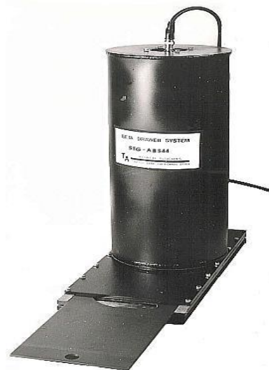
STANDARD DRAWER SYSTEM NO SHIELDING