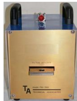
DRAWER SYSTEM WITH 2" SHIELDING