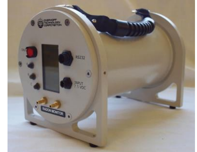
Rn-CAM Radon Detector & Monitor